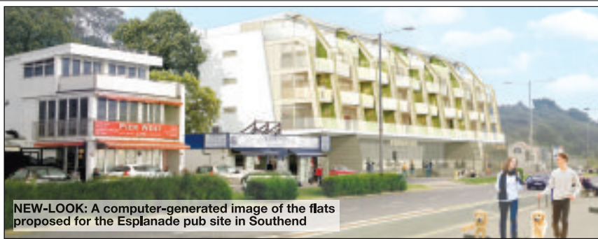
NEW-LOOK: A computer-generated image of the flats proposed for the Esplanade pub site in Southend